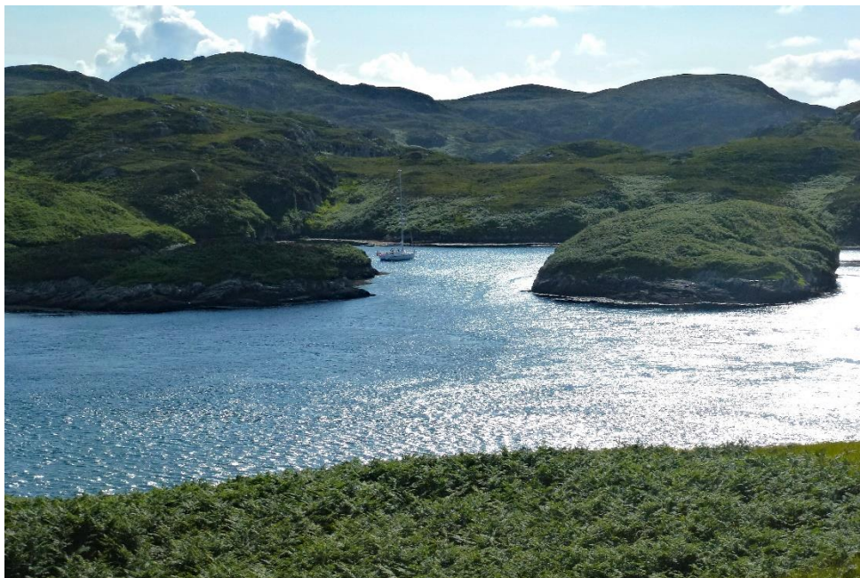
A Single Yacht in Acairseid Fhalaich