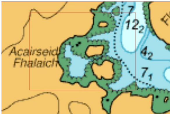
BA 2904 – Landlocked Pool

He was in for a shock! For an initial foray, keeping to the beaten track and, in particular, the anchorages recommended in the excellent Clyde Cruising Club (CCC ) Sailing Directions it was okay. But try something just a little off-piste and you are on your own. After one salutary experience with a late night anchorage in Tarskavaig Bay he decided that he could produce something better and Antares Charts was born. Since then he has to date, produced 592 charts, covering 579 anchorages