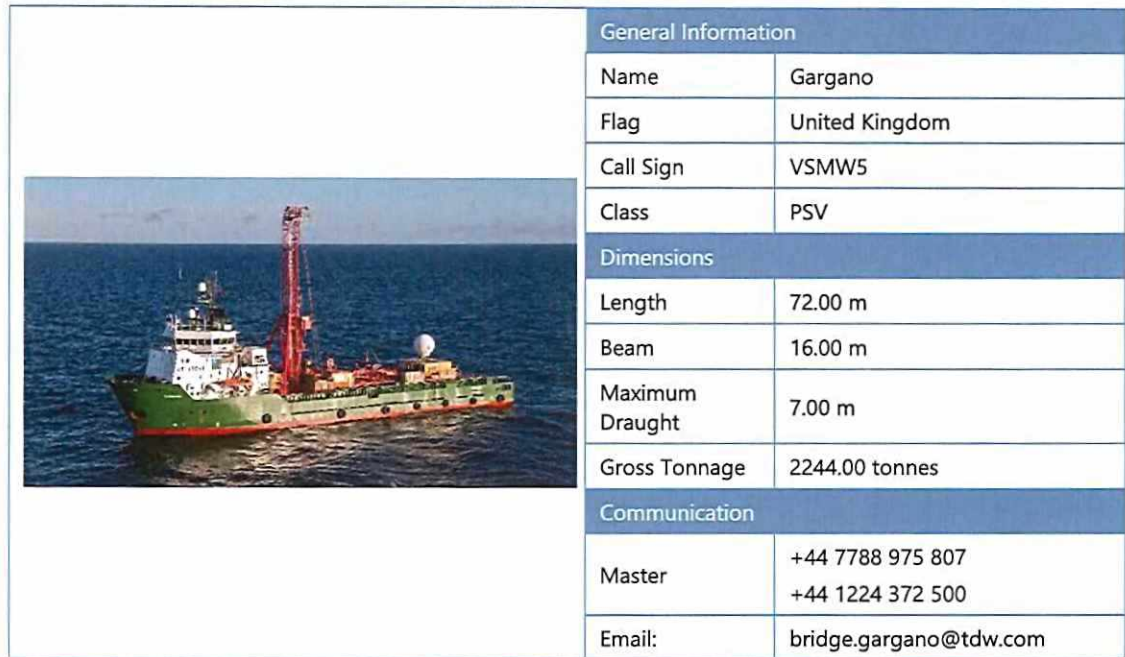
Table 5.1: Gargano

The geotechnical operations will be conducted by the geotechnical drilling vessel Gargano. Client, contractor, and fisheries liaison contact details are provided in the Notice to Mariners distribution list in Section 6.